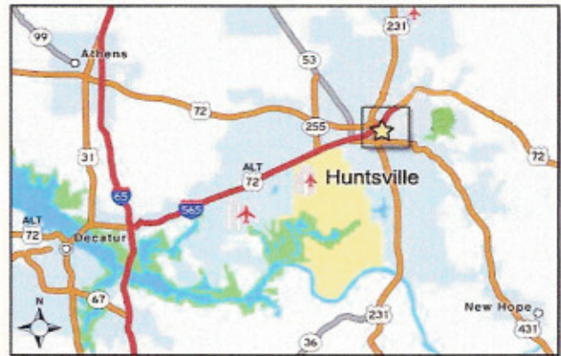
HUNTSVILLE AREA MAP